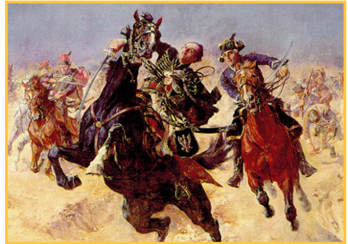
“General Pułaski at Savannah,” by Stanisław Batowski, 1933, hangs prominently at the Polish Museum of America in Chicago.

As the battle ensued, the American infantry was repelled after two assaults. Riding at the head while attempting to rally fleeing French forces during a cavalry charge, Pułaski was mortally wounded by grapeshot.