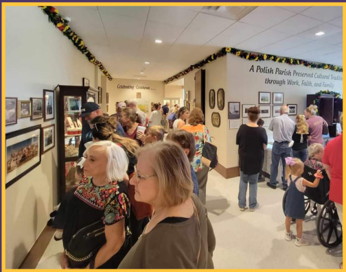
Cestohowa community members view photos and artifacts spanning 150 years.