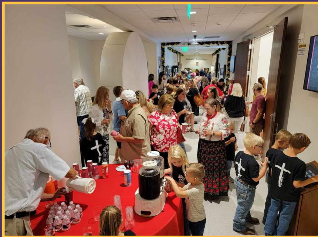
Cestohowa exhibit grand opening