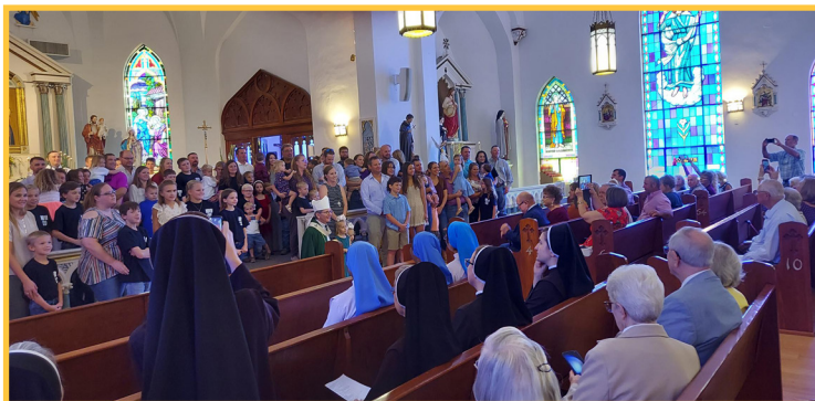
Archbishop Gustavo Garcia-Siller celebrates Cestohowa's 150th anniversary with parish youth.