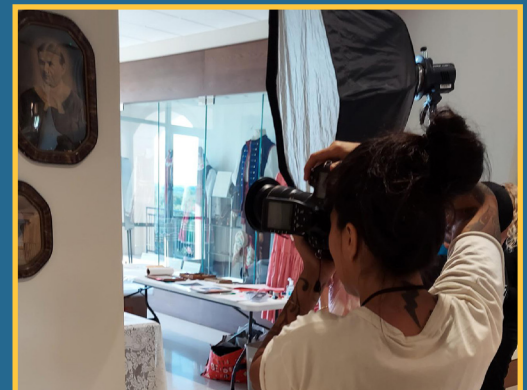
Texas Monthly photo shoot capturing images from the Cestohowa exhibit.

Join PACT for fellowship, food and fun Saturday, Nov. 11 at St. Joseph Catholic Church in Bryan. Events start at 8 a.m. with Mass at 11 a.m. Meal tickets are $20 at the door and $15 online + $1 fee at PACTx.org thru Nov. 9. Processions, Polish dancers, silent auction and more. Join us!